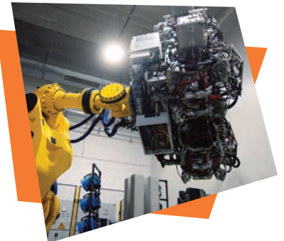
Production of PE products by rotomoulding and robomoulding process