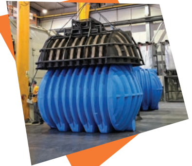
Production of PE products by rotomoulding process